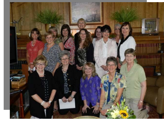
Pictured Top Row: