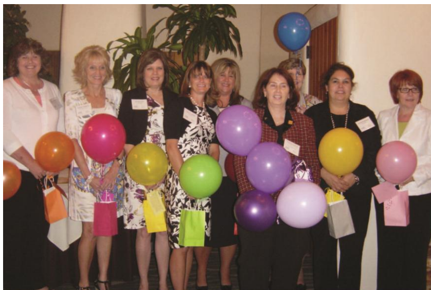
2012/13 Incoming Board Members: