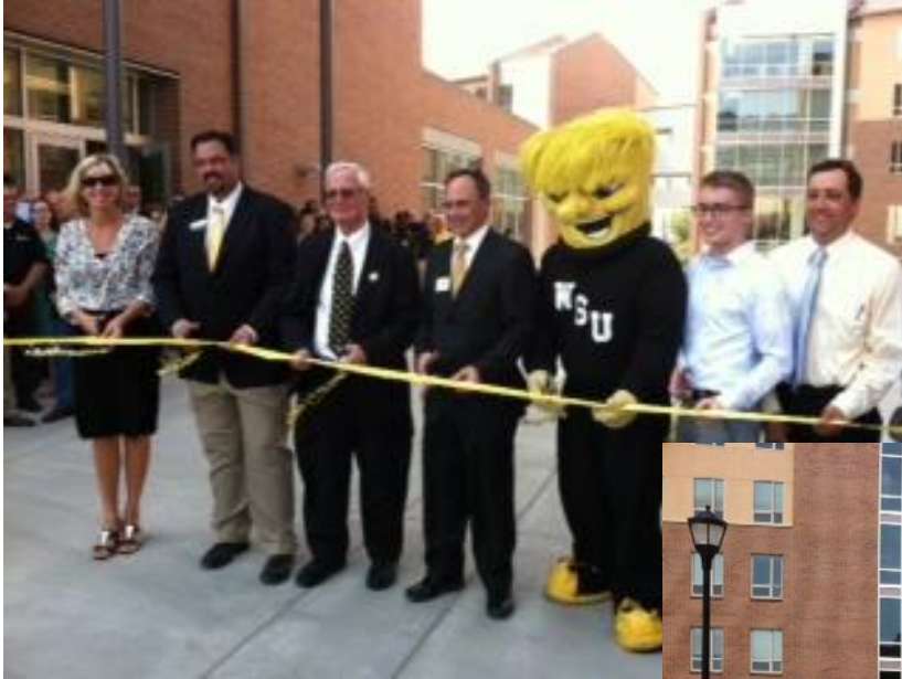
Shocker Hall Ribbon Cutting, Dedication & Open House August 14, 2014