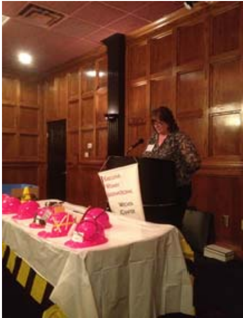
Congratulations to the 2013/2014 EWI Wichita Board of Directors.